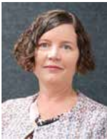
WorkSafe Commissioner for WA